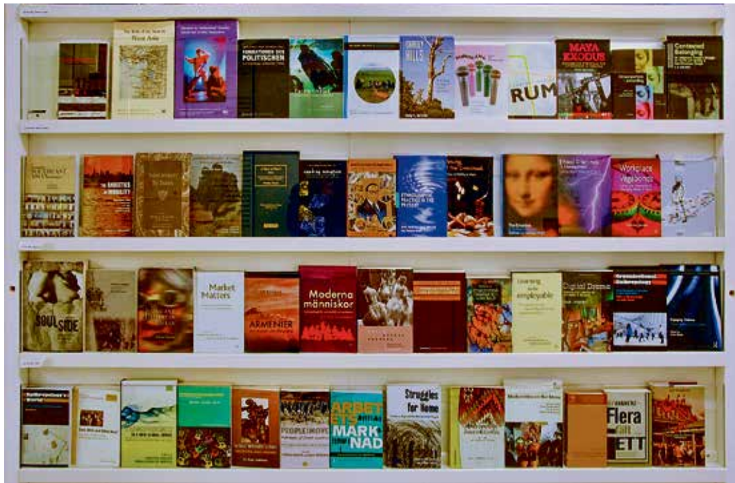
The book cabinet mirrors the width of thematic and regional interests at the Department of Social Anthropology.

With the growing interest in mobilities of all kinds, and the practical and ideational movements that make up people's lives in relation to migration, labour, organizations, policies, and kinship, the Department formulated a programme for its overarching profile, Transnational Anthropology. Subsequently, four thematic clusters were formed – Migration, Media, Environment and Organization.