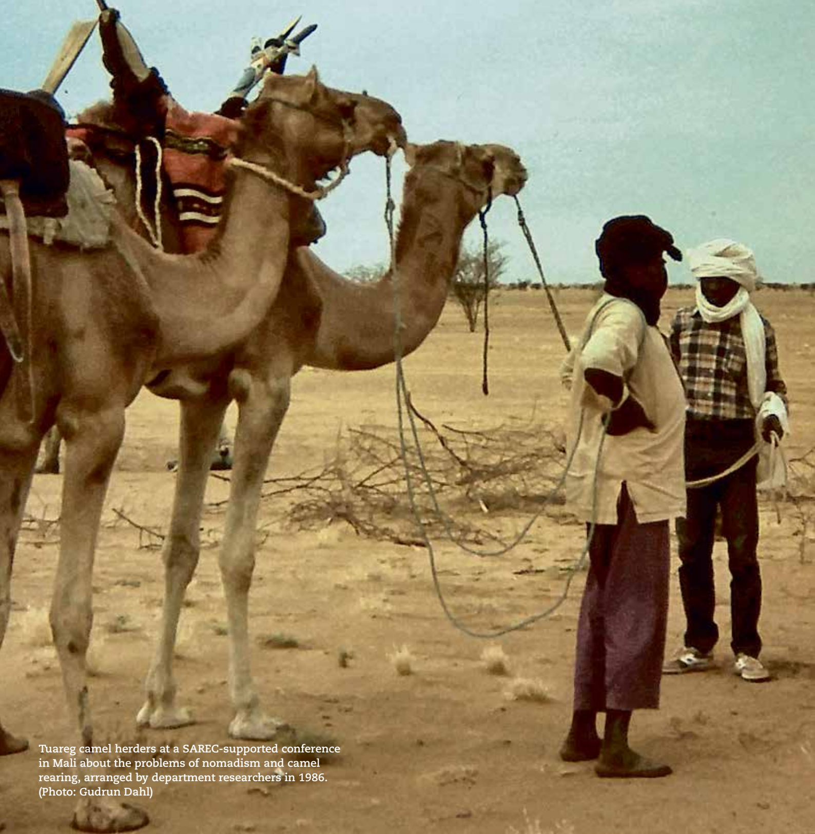
Tuareg camel herders at a SAREC-supported conference in Mali about the problems of nomadism and camel rearing, arranged by department researchers in 1986.