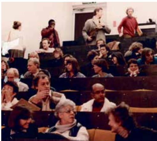
Dissertation defence audience 1987.