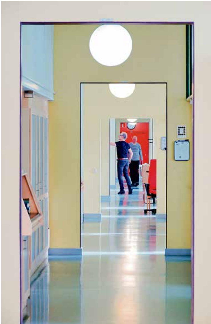
The CHES corridor. CHES offices are converted classrooms, ready to be changed back to their original purpose on request.