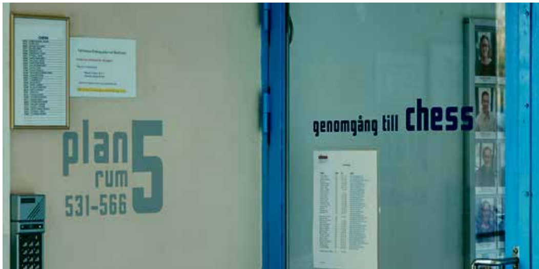
Entrance to CHES offices from the mail hallway of the Sveaplan building.