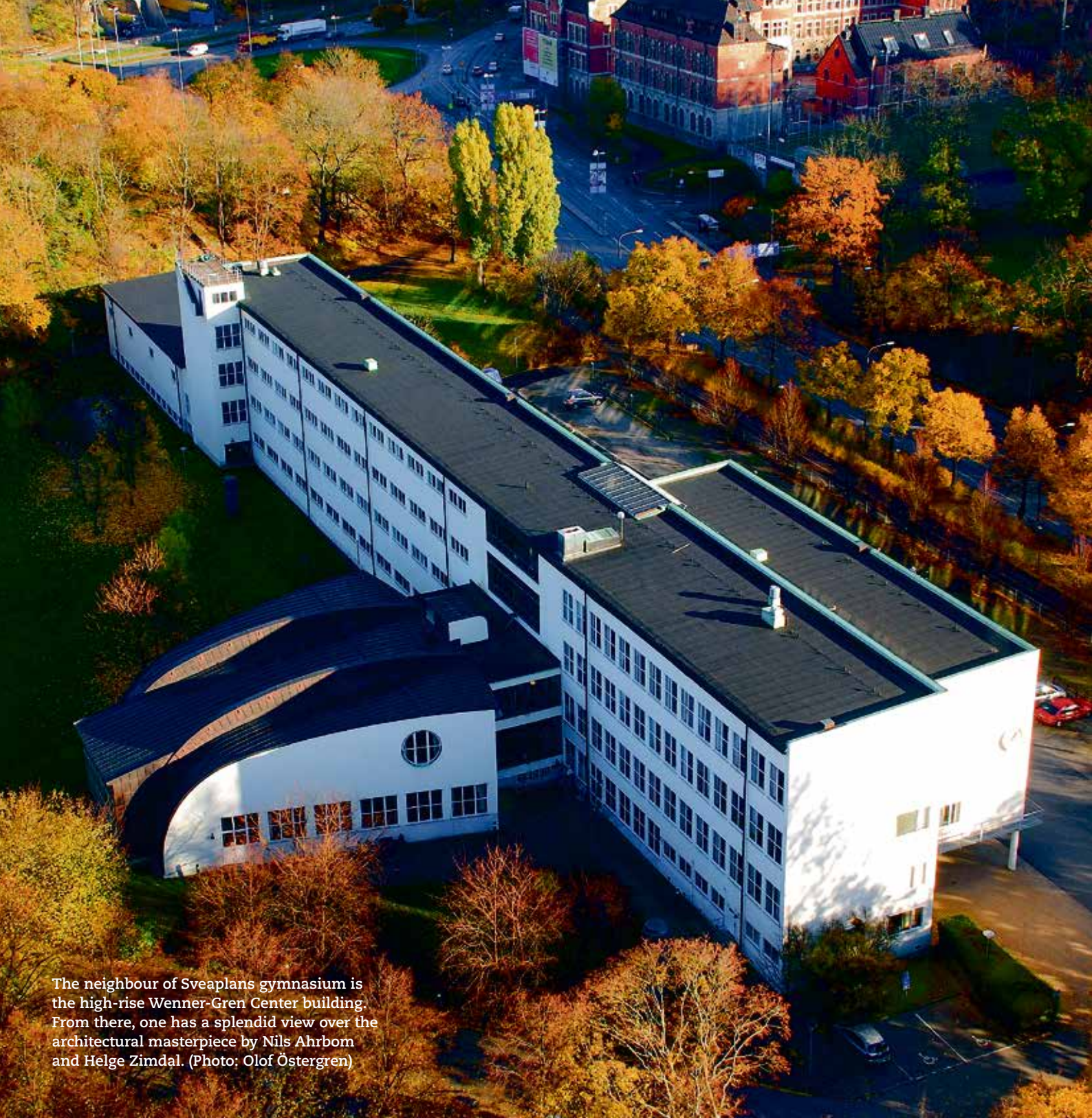
The neighbour of Sveaplans gymnasium is the high-rise Wenner-Gren Center building. From there, one has a splendid view over the architectural masterpiece by Nils Ahrbom and Helge Zimdal.