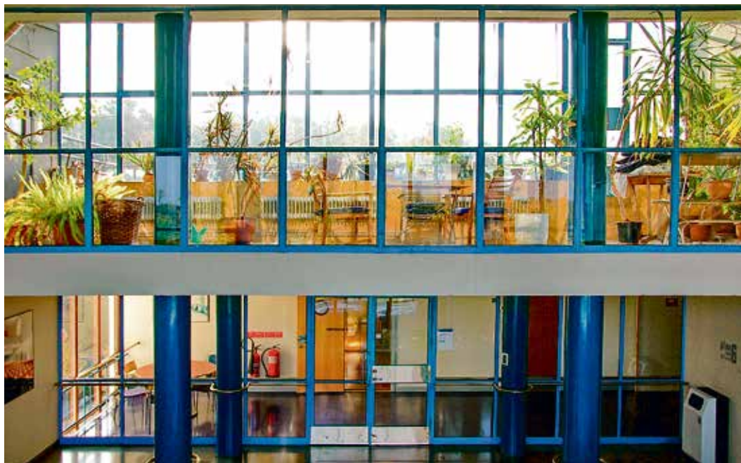
View of the Sveaplan building from the hallway outside the CHES entrance.