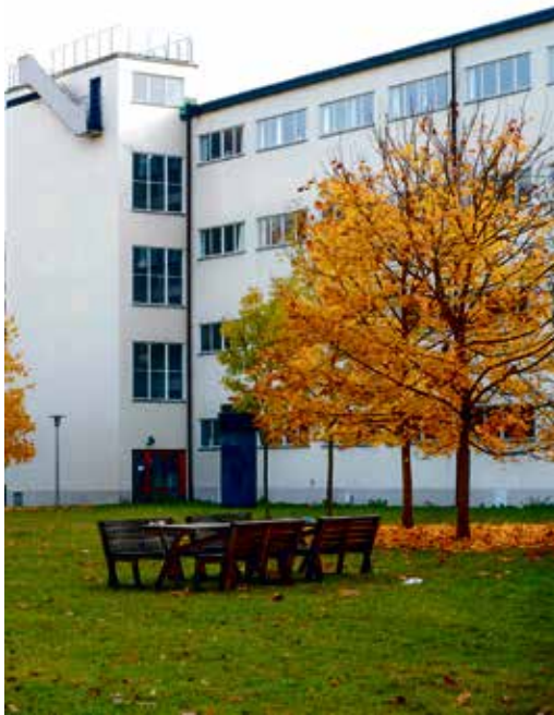
The Sveaplan building from behind.

One of the last strategic decisions that I took part in as director of CHESS was to launch an international ‘Master’s Programme in Population health’, today renamed as ‘Public health’. The board of CHESS discussed this in several meetings, realizing that it was a watershed decision. It encouraged us to take up this new task. The first students, around 25 persons, started in the autumn of 2008; half of them had a Swedish back-